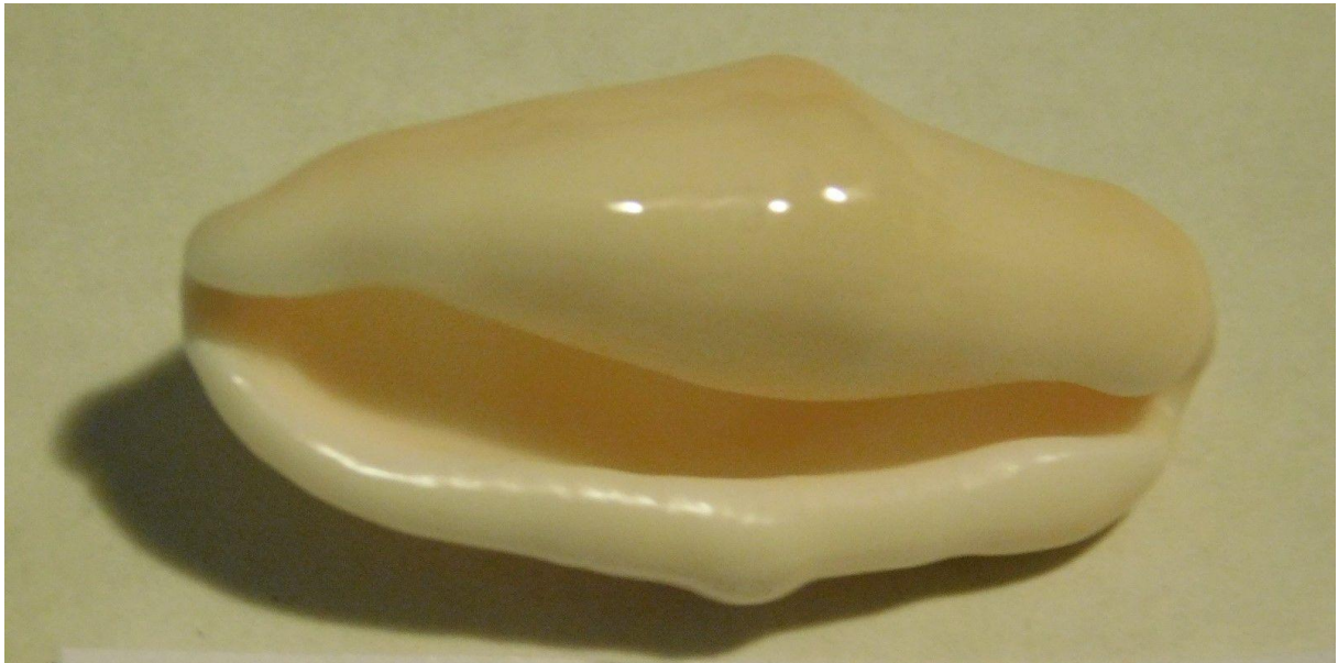
Cyphoma gibbosum (Linnaeus, 1758)