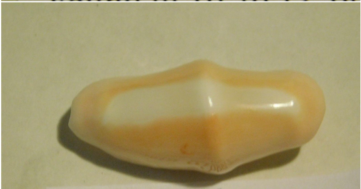
Cyphoma gibbosum (Linnaeus, 1758)